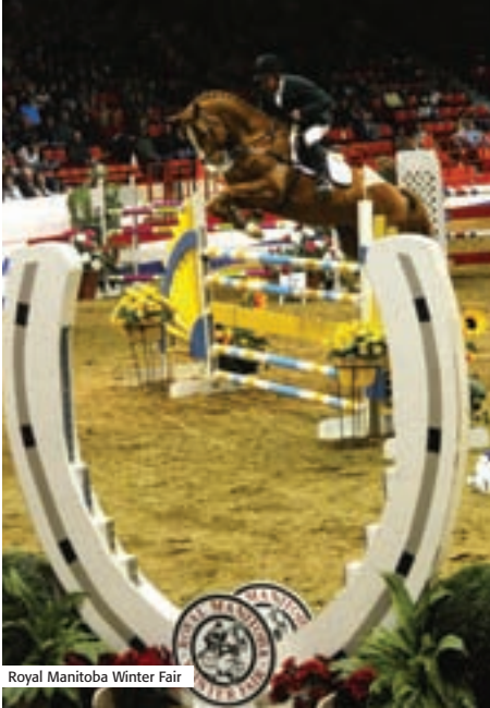
Royal Manitoba Winter Fair