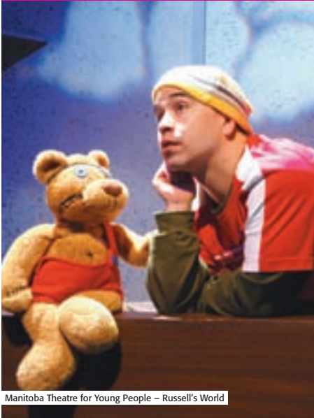
Manitoba Theatre for Young People – Russell's World