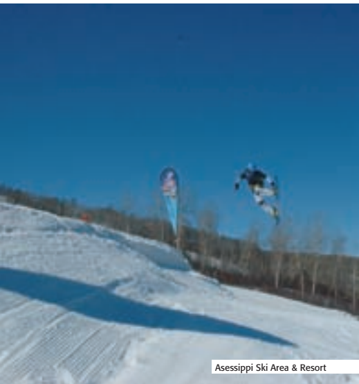
Asessippi Ski Area & Resort

Mar 4-5 | WINNIPEG WINNIPEG SYMPHONY ORCHESTRA MASTERWORKS A SERIES presents Beethoven Violin Concerto, Centennial Concert Hall; 204-949-3999, www.wso.ca