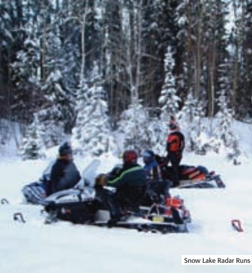
Snow Lake Radar Runs

Apr 1-9 | WINNIPEG MANITOBA THEATRE CENTRE presents Calendar Girls , The John Hirsch Theatre Mainstage; 204-942-6537, 1-877-446-4500, www.mtc.mb.ca