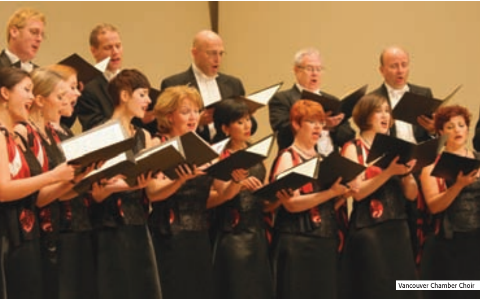
Vancouver Chamber Choir

Mar 1-5 | WINNIPEG MANITOBA THEATRE CENTRE presents The Shunning , The John Hirsch Theatre Mainstage; 204-942-6537, 1-877-446-4500, www.mtc.mb.ca