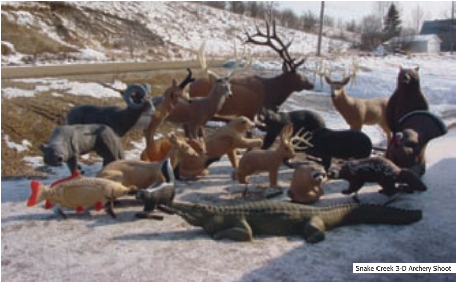
Snake Creek 3-D Archery Shoot

Apr 20 - May 8 | WINNIPEG PRAIRIE THEATRE EXCHANGE presents Wingfield Lost and Found ; 204-942-5483, www.pt.e.mb.ca