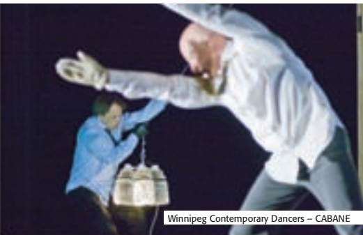
Winnipeg Contemporary Dancers – CABANE