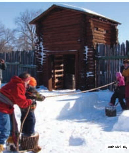
Louis Riel Day

Feb 18-19 | HEADINGLEY HEADINGLEY DINNER THEATRE presents Hanover D. Cash Clinic , Headingley Community Centre; 204-255-1123