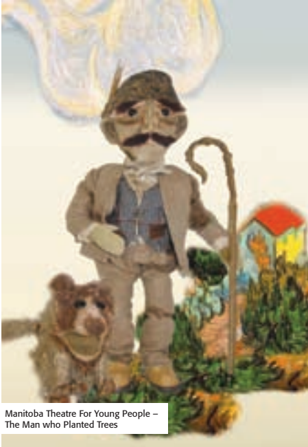
Manitoba Theatre For Young People – The Man who Planted Trees